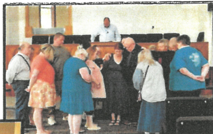
Above: Special time of prayer at the organization service of Antioch MBC in Dexter, Maine.